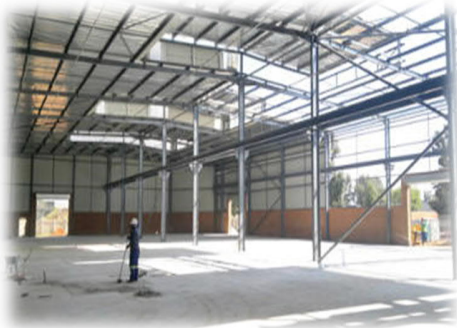
MKB Offices in Parkmore Client- MKB Group