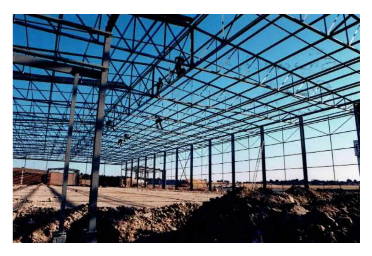
Echo Prestressed Factory Chlorkop